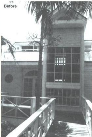
The new entry gazebo, complete with a nautical wrought-iron chandelier, makes an awe-inspiring statement.